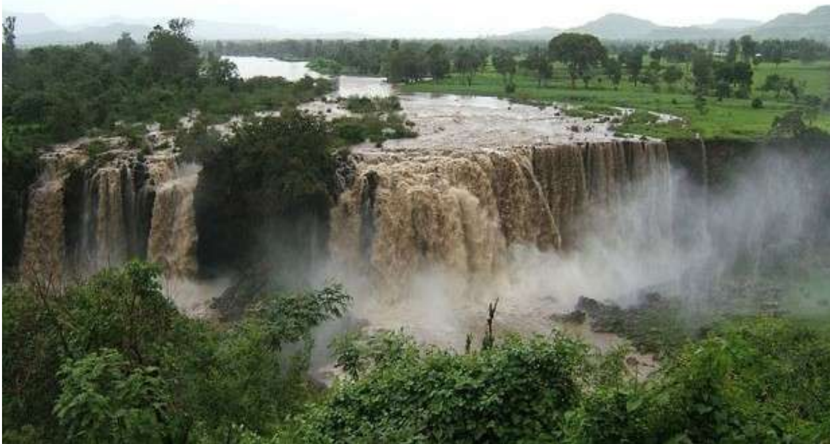
Blue Nile Falls