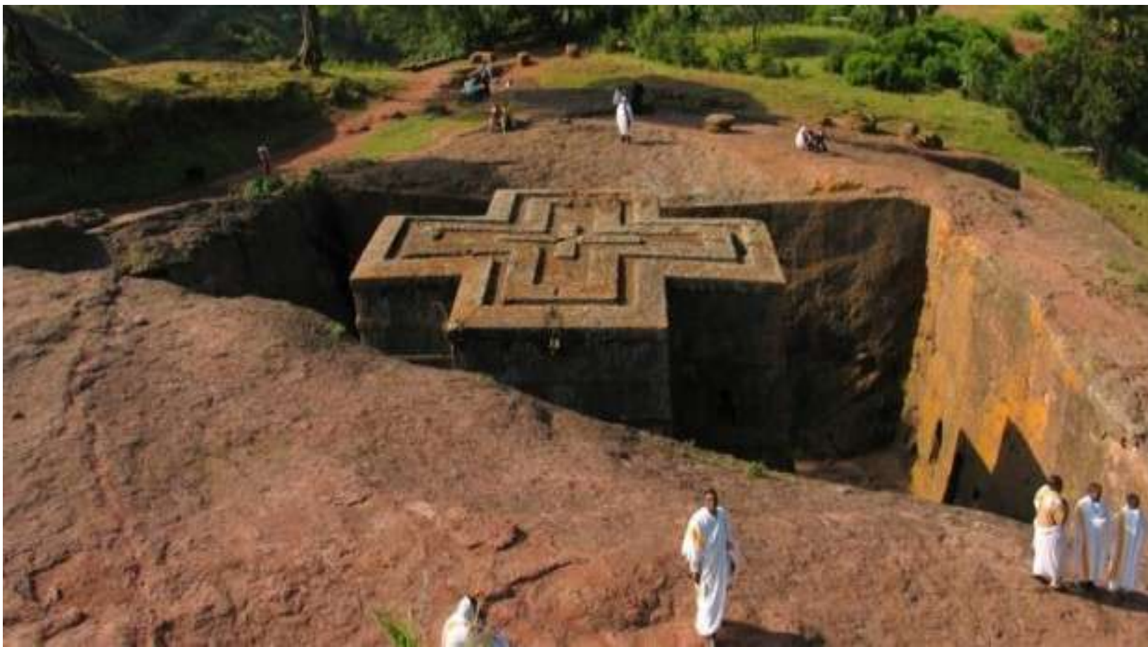
Bete Giyorgisin, Lalibela, Ethiopia