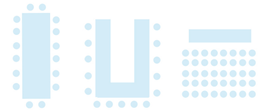
Conference U-Shaped Theater