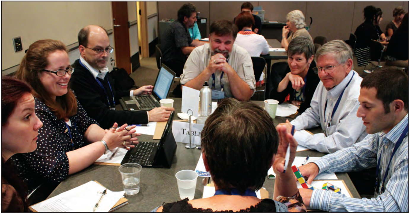
URECAS workshop participants discuss challenges and solutions